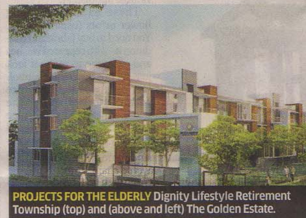
PROJECTS FOR THE ELDERLY Dignity Lifestyle Retirement Township (top) and (above and left) The Golden Estate.

of Indian local games are available. Then there are also Internet-browsing services, a well-stocked library of books and magazines, Health Club and Fitness Centre, and auditorium. Activities for physical well-being like fitness, yoga and meditation classes as well as spiritual discourses are part of